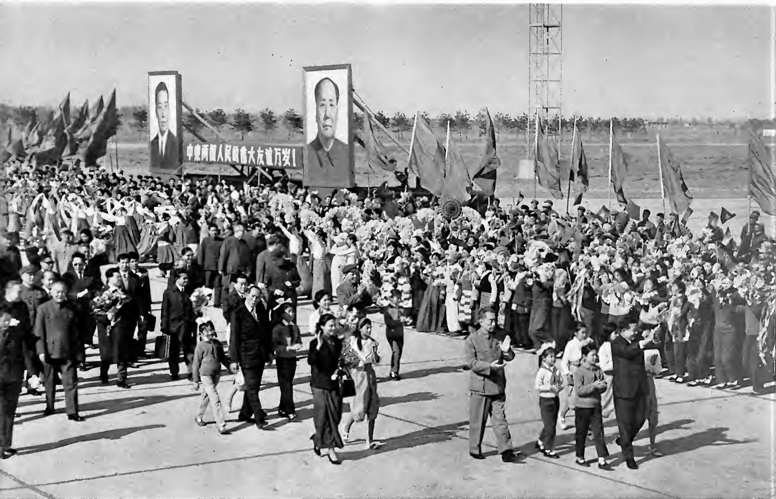
Samdech Norodom Sihanouk, Head of State of Cambodia, and other distinguished Cambodian guests arrived in Peking on April 11 after an inspection tour of the Liberated Zone of Cambodia and a friendly visit to the Democratic Republic of Viet Nam. They are warmly welcomed at the airport by Premier Chou En-lai and other Chinese leaders and more than 5,000 people.

S AMDECH Norodom Sihanouk, Head of State and Chairman of the National United Front of Cambodia, and Madame Monique Sihanouk, in the company of Special Envoy Ieng Sary, made an inspection tour of the Liberated Zone of Cambodia in March, 1973.